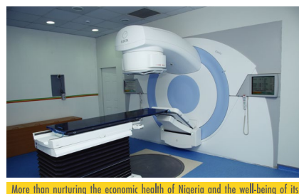
More than nurturing the economic health of Nigeria and the well-being of its people, SNEPCo is committed to improving access to medical services and strengthening healthcare systems in Nigeria. Working in collaboration with the Nigerian National Petroleum Corporation (NNPC) and our co-venture partners, our signature medical intervention for effective and efficient cancer treatment in Nigeria is the Elekta Synergy Linear Accelerator Radiotherapy machine donated recently to the National Hospital Abuja.