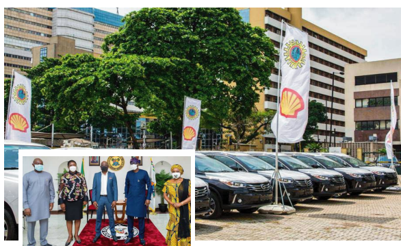
Enhancing security of lives and property in Nigeria's commercial capital of Lagos where SNEPCo and its co-venture partners have their headquarters was a focus area of intervention by the NNPC/SNEPCo partnership. A major support to the state government was the donation of 16 units of security vehicles to the Lagos State Security Trust Fund (LSSTF) for effective patrol and improved response time to distress calls.

From Anambra to Abuja and from Rivers to Nassarawa, the COVID-19 support to governments and the many other social investment programmes of SNEPCo in health, education and sports, the thousands of beneficiaries of the initiatives and supply chain are learning that the Bonga story extends far beyond oil.