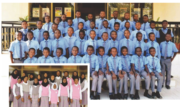
NNPC/SNEPCo National Cradle to Career (NC2C) scholarship programme has continued to offer opportunities to pupils from less-privileged background in public primary schools to have full scholarship including full board, tuition, education supplies, health insurance, and uniform for the six years of secondary school. Over 472 students have since benefited from the NC2C programme. University scholarships are offered to the beneficiaries on the successful completion of their secondary education and in line with set criteria.