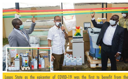
Lagos State as the epicenter of COVID-19 was the first to benefit from the NNPC/SNEPCo partnership intervention in the fight against the pandemic. The state received donations of PCR testing machines and test kits; High-Grade Plasma Apheresis machine; intensive care unit ventilators; critical care hospital beds and mattresses; ICU ambulance; AED machine (defibrillators); a 150kva generator, 30-50kva alternative solar power system plus inverters installed at the Infectious Disease Hospital, Yaba; among others.