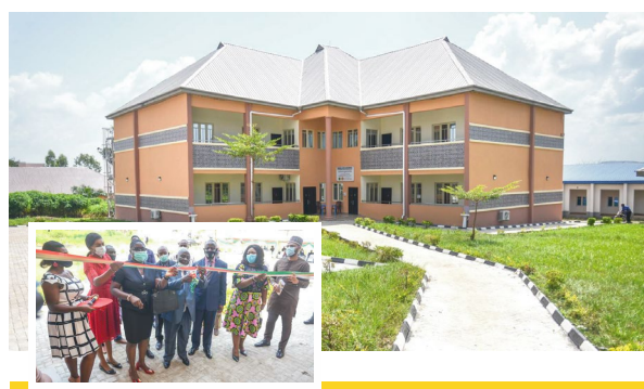
A world-class ICT Centre was donated to the Enugu State University in an effort to boost ICT education and stimulate scholars' and research interest to meet with global standard and provide solutions to world's contemporary digital challenges. The donation was in furtherance of the NNPC/SNEPCo ICT support programme started in 2007 and which has so far donated 29 ICT projects to secondary schools and universities around the country. Some of the beneficiary schools are: Ikeja Grammar School, Lagos State; Ofo Grammar School, Kwara State; Eshute-Efufun Secondary Schools, Lagos State; Rumfa College, Kano State; St Barnabas College, Kabbia, Kogi State; Girls Secondary School, Ameriawa, Imo State; Uvheru Grammar School, Delta State; and Edo College, Benin, Edo State. Others are: Delta State University, Abraka; University of Jos, Plateau State; Imo State University; University of Ado Ekiti, Ekiti State; and Ambrose Alli University, Ekpoma, Edo State.