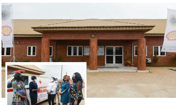
The NNPC/SNEPCo partnership enhanced access to quality healthcare in Ogun State with a focus on maternal and child health for the various communities served by Ogijo Primary Healthcare Centre in Sagamu Local Government. A model comprehensive primary health centre including an ambulance, doctors' residential quarters, on-grid and solar-powered 20-bed wards, water treatment plant, was constructed and donated to the state government.