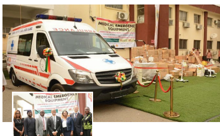
State-of-the-art medical emergency equipment, including medical consumables and ambulances, was donated to the casualty and trauma sections of the General Hospital, Odan, Marina in Lagos State. The facility was also refurbished and upgraded.