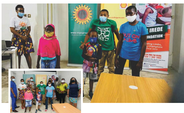
The NNPC/SNEPCo partnership supports those with special needs but who have little or no resources to meet such needs. Working with NGOs, the partnership provides prosthetic limbs to help amputees to walk.