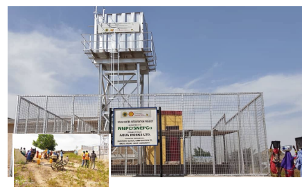
Completed 5000 gallons Solar Hybrid System Powered Water, Sanitation and Hygiene facility provided by NNPC/SNEPCo as part of its humanitarian intervention in Kwaya Local Government Area of Borno State. Project was completed in 2020 serves over 11,450 people resident in Kwayakuser community.

Shell Nigeria Exploration and Production Company Limited